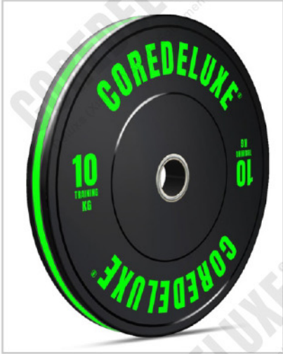
10KG 34MM TRAINING