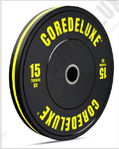
15KG 47MM TRAINING