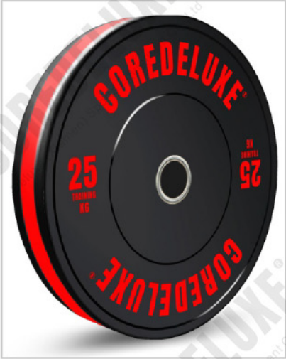
25KG 70MM TRAINING