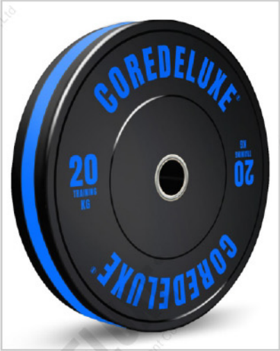
20KG 58MM TRAINING